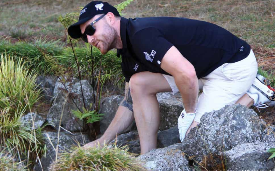
Brendon McCullum fishing for golf balls during The Players' Golf Day.