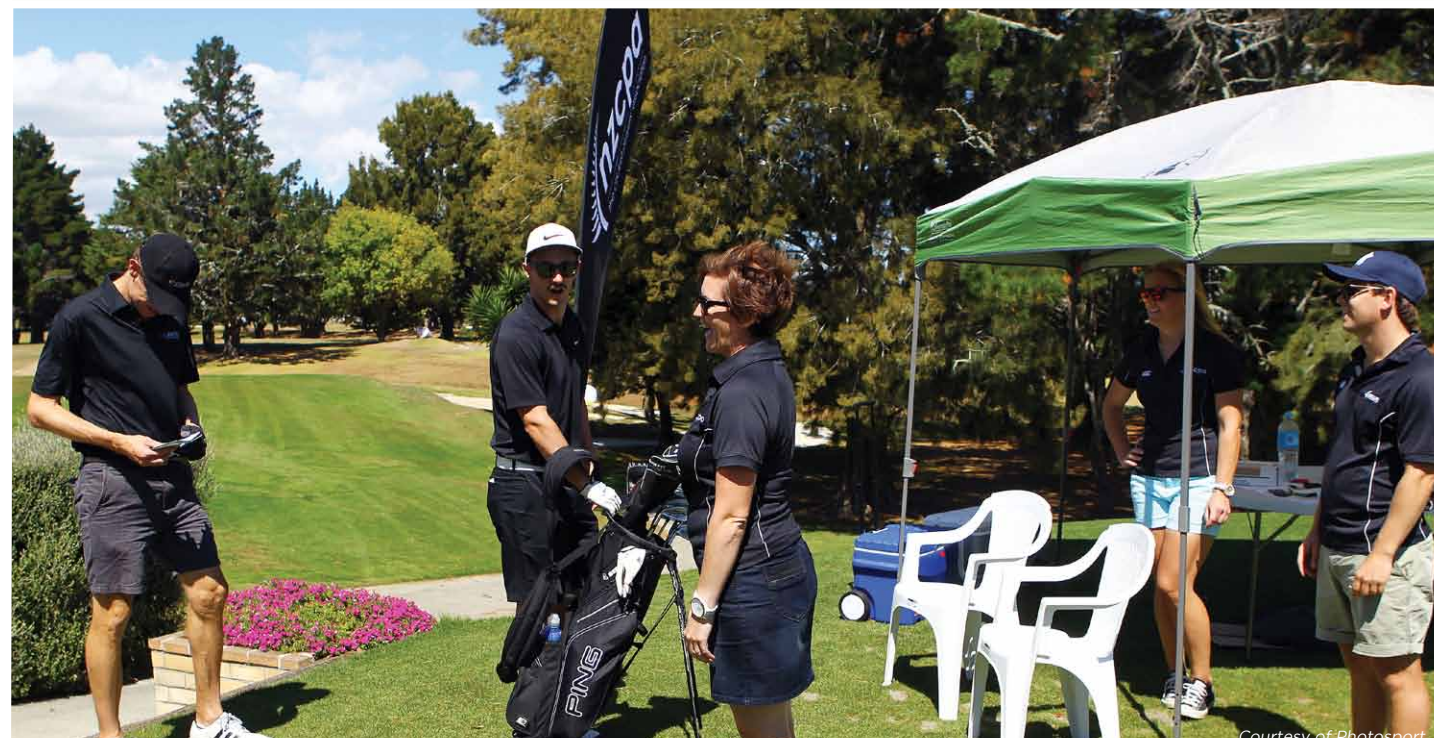
The Players Golf Day - raising money for The Cricketers Hardship Trust